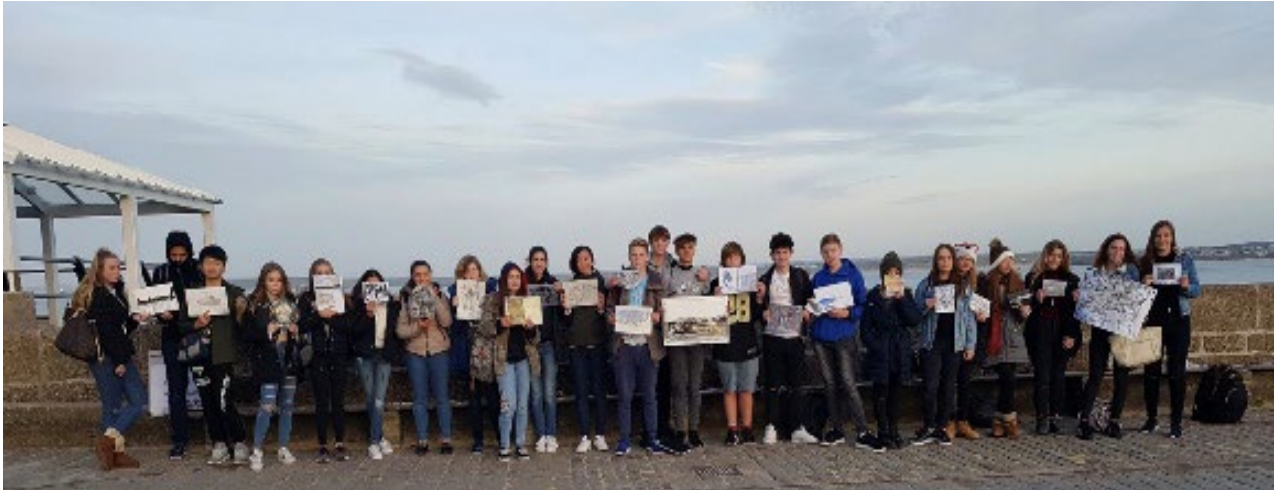
Art trip to St Ives

The Department remains open for three evenings per week and during lunchtimes with a variety of clubs and opportunities for students to drop-in to seek extra guidance or simply a place to work. Also, within the School's campus, a spacious facility outside of the Department serves to deliver bespoke Art workshops for boarding students. Art trips at home and abroad form an important part of the Art experience. Recent destinations include Barcelona, Berlin, Cornwall and New York. In the North Gallery, situated in the heart of the School, exhibitions of student work are displayed in a professional manner throughout the academic year.