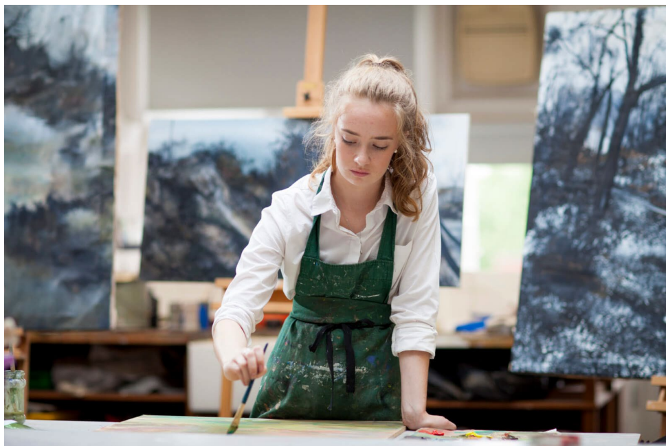
Sixth Form fine artist at work

In Fine Art, students are encouraged to work imaginatively and expressively in a wide range of media, including drawing, painting, printmaking, sculpture, textiles and mixed media. The use of new media is also encouraged to allow an inclusive course for those students less confident in traditional skills. Students studying GCSE Art & Design (Photography) experiment with media, processes and techniques, utilising a spacious darkroom and a range of new computers. All students possess their own iPad that helps to facilitate rapid artist research, primary source gathering and additional digital experiments. At A Level, we continue to offer both Fine Art and Photography.