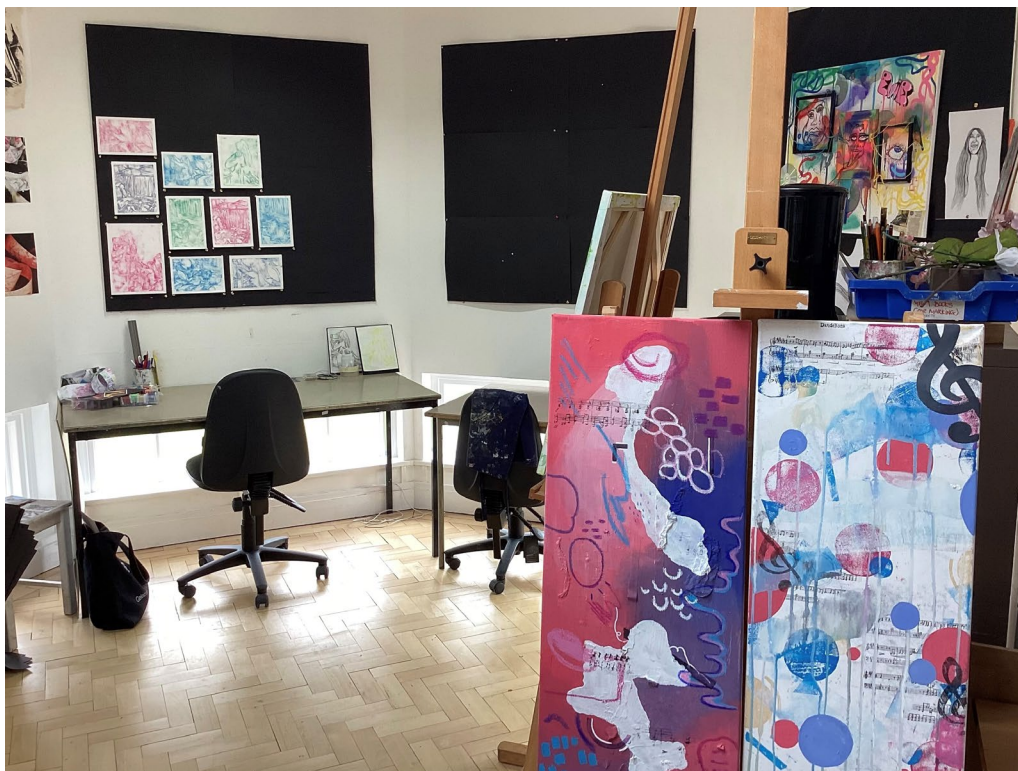
Year 13 Art Studio

The rooms in this dynamic and high-achieving Department are housed within the historic former palace of Henry VIII, described as “a warren of atelier-style studios” by the Good Schools’ Guide. Art & Design is currently being delivered by four teachers in the Senior Divisions, supported each day by a specialist technician. The Art, Design & Technology Department currently has well-resourced teaching rooms and studios alongside a variety of other teaching and learning areas and generous storage space. Currently, we provide an individual and permanent studio space for every Year 13 student in Art and Photography. In addition, there is a well-equipped computer suite with opportunities to work in Photoshop and also a darkroom and other useful spaces that facilitate a variety of analogue and new media approaches. Teaching staff receive an iPad and a laptop to assist in their delivery of the subject. Each student is given their own iPad, including useful digital applications such as Procreate.