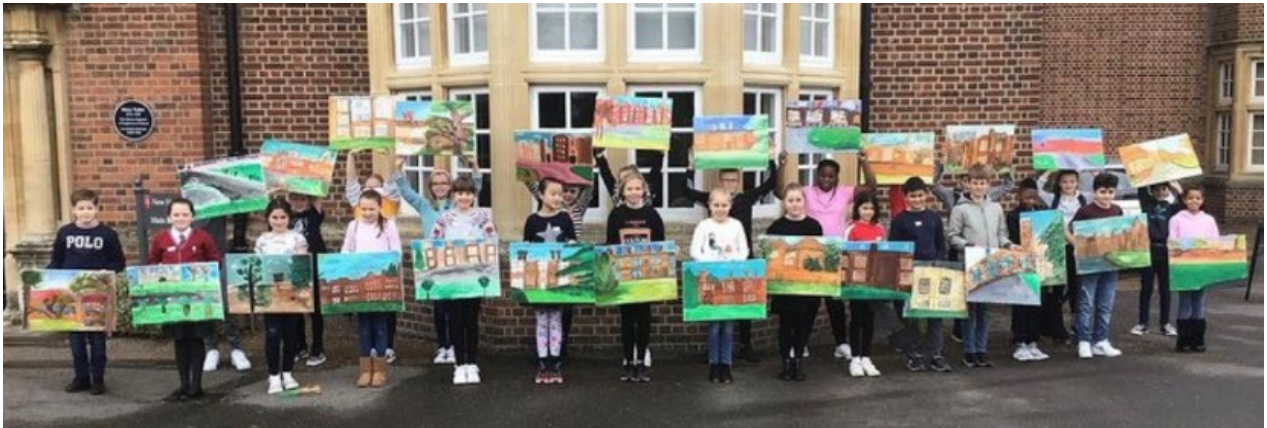
Saturday Art Workshop for local children

Diversity of work and a strong co-curricular offering are characteristic features of the Art, Design & Technology Department at New Hall. Our students are encouraged to find their own creative voice, as a starting point for their personal development as young artists and designers. The Department is open for students to visit throughout the week, and this allows them time to develop their individual style and to compile extensive portfolios. The teaching staff are also enthusiastic practitioners, embracing the widest possible range of approaches to Art & Design, and encouraging the students to adopt a critical attitude towards artwork. We believe that Art & Design gives students a distinctive voice to explore and express whatever is relevant to them.