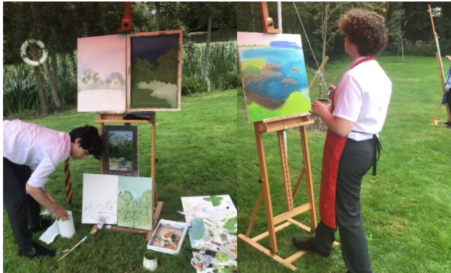
Year 10 GCSE artists at work in the New Hall Chaplaincy Gardens