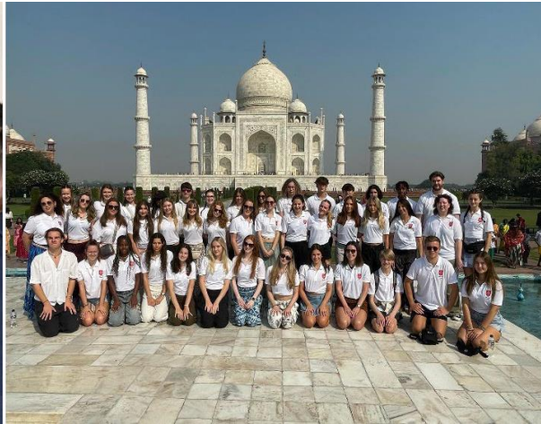
Theology trip to India in 2023