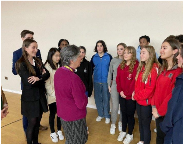
The Rt Revd Dr Guli Francis-Dehqan, Bishop of Chelmsford, gives a talk to students on Theology and prayer in 2023

On top of these opportunities, our students are encouraged to enter external and internal essay competitions throughout the year, and we regularly host talks from guest speakers such as Peter Vardy.