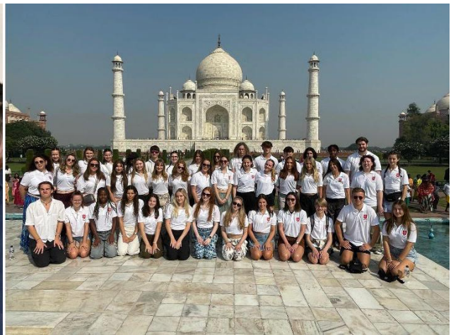
Theology trip to India in 2023