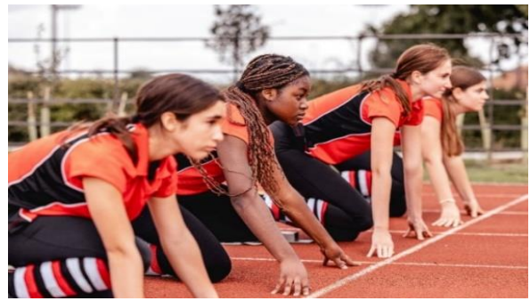
Our Track Teams compete in county, regional, and national competitions