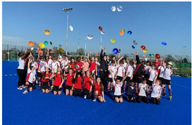
Hockey Camp for Years 3-13 offered during School holidays

The School runs pre-season training and offers hockey camps for Years 3-13 during School holidays.