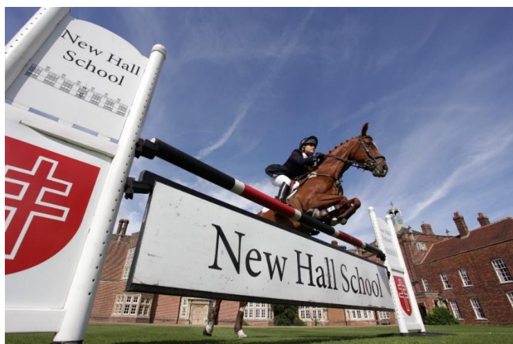
In 2023, New Hall is opening a Learn-to-Ride Centre on the New Hall site, as well as an Equestrian Centre at New Hall Park Farm (2.9 miles from New Hall)

New Hall School has a rich history in equestrian sports and, in 2022, our riders qualified for Nationals in the 80-85cm Show Jumping and competed in the National and Plate Championships at Keysoe, achieving 1 st and 4 th in Arena Eventing. The School has links with Chelmsford Equestrian Centre. In 2023, New Hall is opening a Learn-to-Ride Centre on the New Hall site, as well as reopening its Equestrian Centre (that had closed in 1986), now located at New Hall Park Farm (2.9 miles from New Hall). Our new Head of Equestrian Centre joins the staff team in September 2023. New Hallians have represented Great Britain in a variety of disciplines, in particular Eventing.