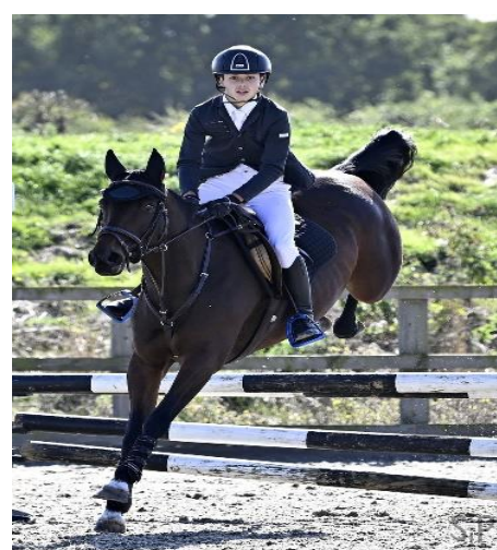
Our Equestrian Team represents the School in National Schools Equestrian Association (NSEA)