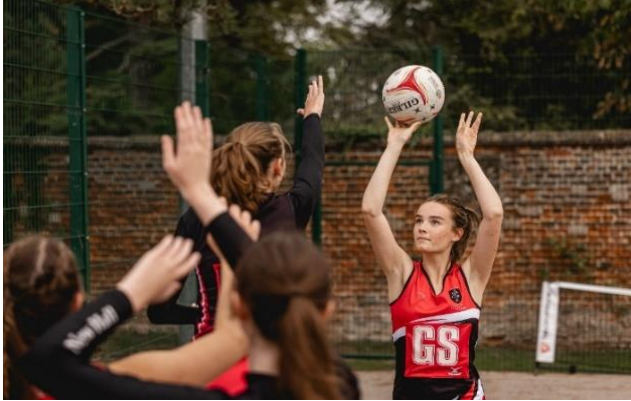
Our students enjoy outstanding training and facilities

Netball is played in both the Preparatory and Senior Divisions, and we have been successful in the Independent Schools National Cup. Our students have gained places in County Academies and National Superleague Franchise Pathways for the 2022-2023 season, following several rounds of competitive trials. We have several students in Essex County Academy, U18 Saracens Mavericks Futures Hub, and London Pulse Hub across a number of age groups.