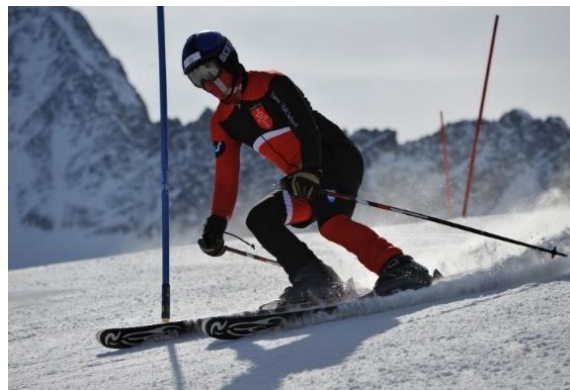
Our students have been selected to compete at the World Schools Ski Championships