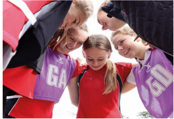
Teamwork is a key element in our success