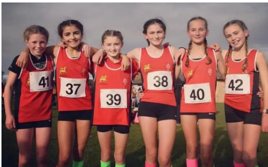
Our Junior Cross-Country Team, 2 nd in the English Schools Athletics Association Finals 2022

We have high uptake in girls' and boys' Athletics track and field, Cross-Country and Running Clubs, and have achieved great success in district, county and regional competitions, as well as National Finals. In the Michaelmas Term 2022, we won the Eastern Cross-Country Championships, and our Junior Girls Cross-Country team came 2 nd in the English Schools Athletics Association Finals.