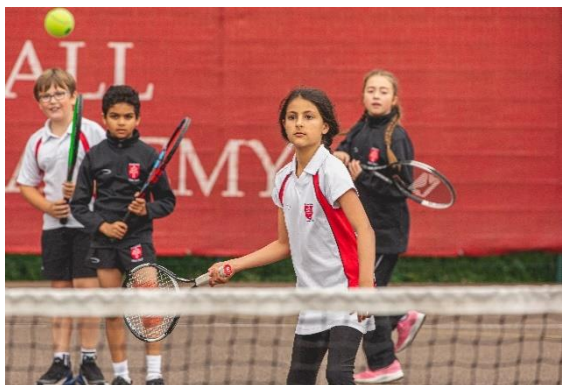
Our students benefit from individual and team coaching in the Preparatory and Senior Divisions

We have an established tennis programme, and, among the many notable team and individual achievements, our students have won county titles and have represented England. In 2022, members of our New Hall Tennis Team won the Ladies Junior Doubles J3 Saint Cyprien in France, the Fred Perry Championship Finals U16 Boys competition, and the Woodford Wells Open Grade 3 U16 Ladies Singles. Our New School Tennis Team plays regular fixtures as well as the junior event 'Road to Wimbledon', and our senior players have reached Wimbledon qualifiers. In 2022, our Senior Girls' team was the runner-up at the National Schools' U18 Girls' Championships.