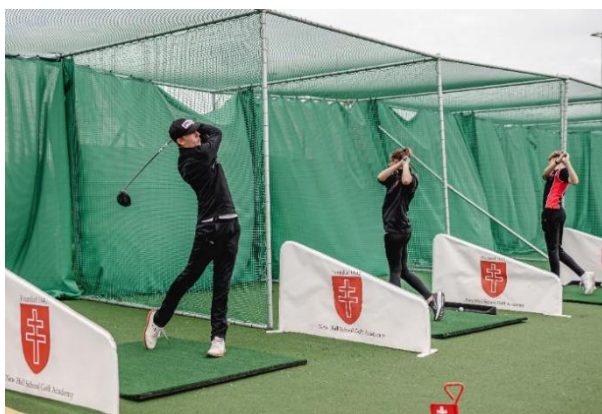
Our students benefit from 12 on-site golf nets and launch monitor, and regular access to a local driving range and golf course

New Hall School has developed an outstanding reputation in golf, and now has more than 100 students training regularly. We have excellent facilities, including 12 on-site golf nets & launch monitor, and regular access to a local driving range and golf course. Our students have secured victories against some of the country's elite players at U16 and U18 level, and we regularly compete at major competitions such as the Independent Schools Golf Association, British Schools and HMC competitions, as well as the Alexander Quinn Invitational. We have a number of students playing at county level, as well as England Girls' Regional Squads and England Boys' U18 Squad. In 2023, members of our team will be competing at the Golf World Junior Championships.