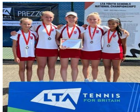
New Hall came 2 nd at the National Schools' U18 Girls' Championships