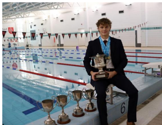
Our Senior Swim Academy Captain winning five events at the East Regional Championships