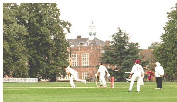
1 st XI cricket match at Six Acres at New Hall