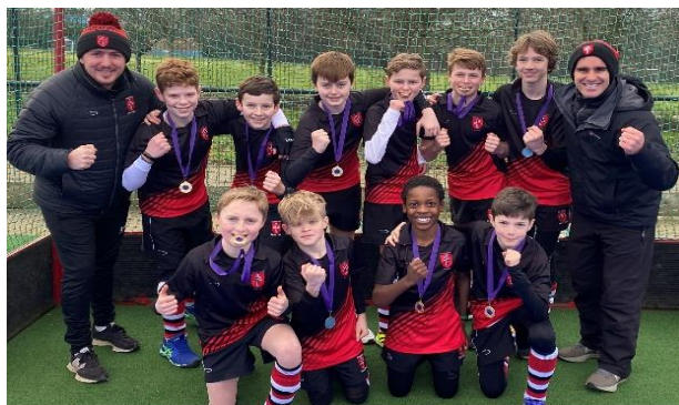
U12 Boys: 2023 Essex Champions