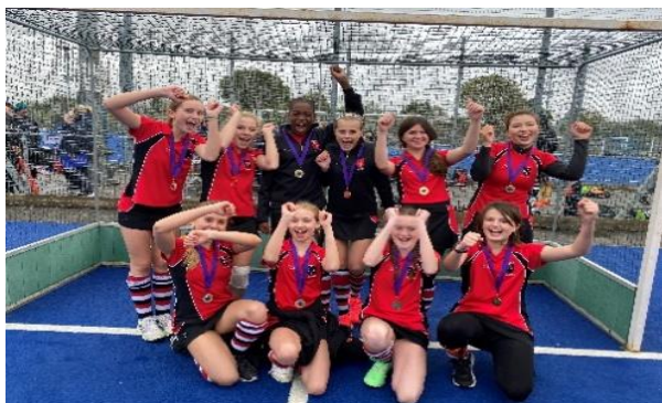
U13 Girls: 2022 Essex Champions