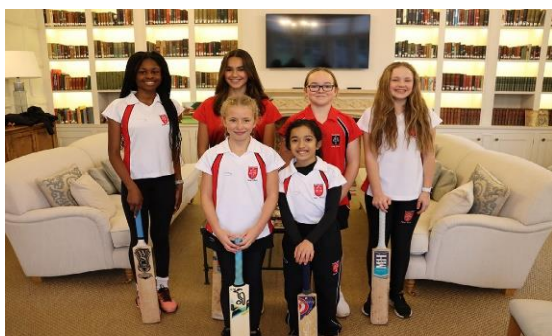
Girls' Division cricketers selected for Essex County Cricket Squads

We have five cricket squares, outdoor and indoor nets, and strong uptake across girls' and boys' cricket in Preparatory and Senior Divisions. Across Years 5 and 6, for example, more than 40 students train each week. A number of our students play at county level and within the player pathways for Essex County Cricket. One of our Sixth Form students is a member of the Scotland Under 19 World Cup Qualifiers Squad.