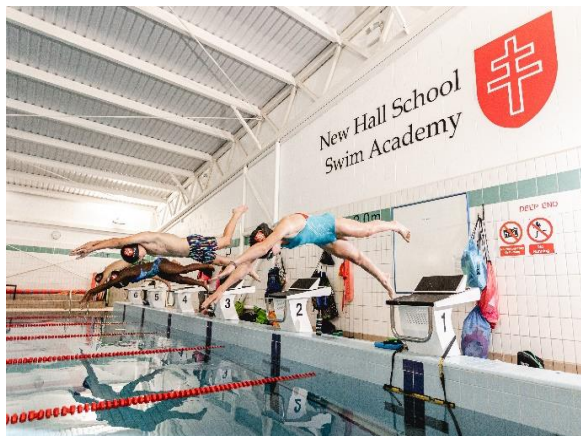
Members of New Hall Swim Academy

As part of its Swim Academy, New Hall runs a Swim Club accredited by Swim England East Region. Our students have benefitted from elite coaching from some of the country's finest swimmers, including recent Olympians and Commonwealth medallists. Our students achieve remarkable success in elite level competitions, most recently including ISA and East Regional Championships, and have competed in National Finals. In the Michaelmas Term 2022, our Junior Boys freestyle relay team won the silver medal at the English Schools' National Competition. Our Swim Academy includes a number of swimmers who are among the finest in their age group nationally.