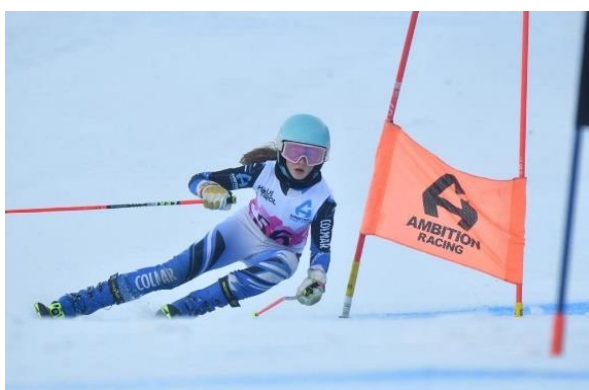
One of our New Hall skiers has been selected to represent Great Britain at the International Children's Races, 2023

New Hall Skiing Team is among the most successful skiing teams in the country. Under the guidance of our Head of Skiing and coaches from an external ski company, we regularly train at Brentwood Dry Ski Slope and compete in the UK and internationally. Our team has achieved outstanding success, winning a great number of team and individual events at the ISA Indoor Championships, at British Interschools Championships, BSA Championships and the ESSKIA British Finals. Our students have been selected to represent Team GB; additionally, in 2023, two of our students will be competing at the highly prestigious World Schools Ski Championships in Turkey.