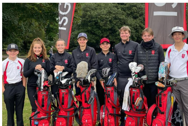
Members of our golf team competing at the ISGA National Championships