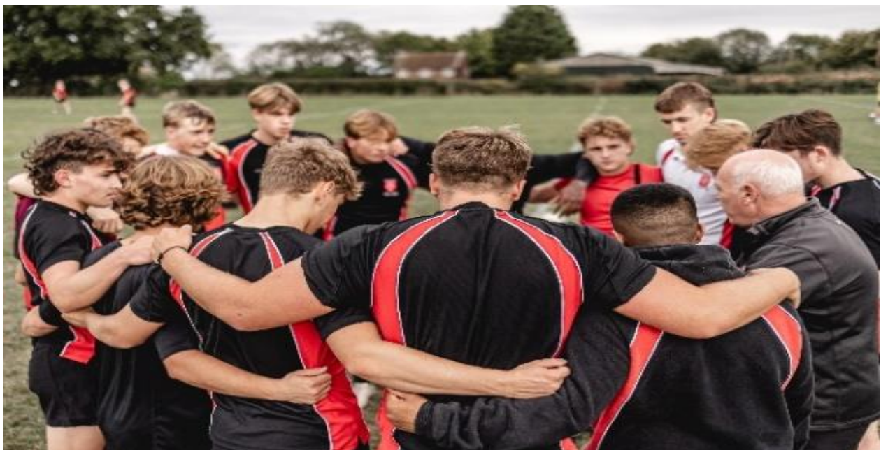
Our 1 st XV benefits from expert training as well as regular strength and conditioning sessions and video analysis

New Hall has an established reputation in Rugby, and we field up to 25 teams across the age range from Preparatory Division to Senior Divisions in contact rugby in the Michaelmas Term. There are opportunities for girls to learn to play rugby. We also offer inter-house non-contact rugby. In the Lent Term, we field six teams in Rugby Sevens and enter major tournaments, including the Rosslyn Park Sevens. Within our Rugby Programme, we have regular strength and conditioning sessions for our elite teams, and we use video analysis. A number of our students play rugby at county level, and several New Hallians have gone on to play professionally, for teams such as Saracens, Munster, Worcester Warriors and Leicester Tigers, and have represented England School Boy and England U20 level. A Year 13 student has played for the U18 Saracens Centre of Excellence Women's team in 2023 against London Wasps and Harlequins.