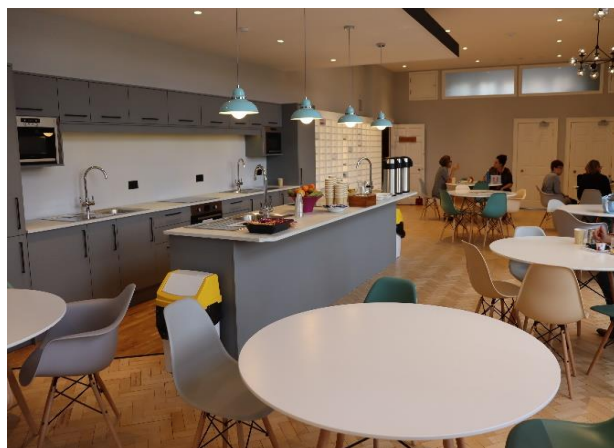
Views of New Hall (above left) and the staff room (above right), located in the main School building