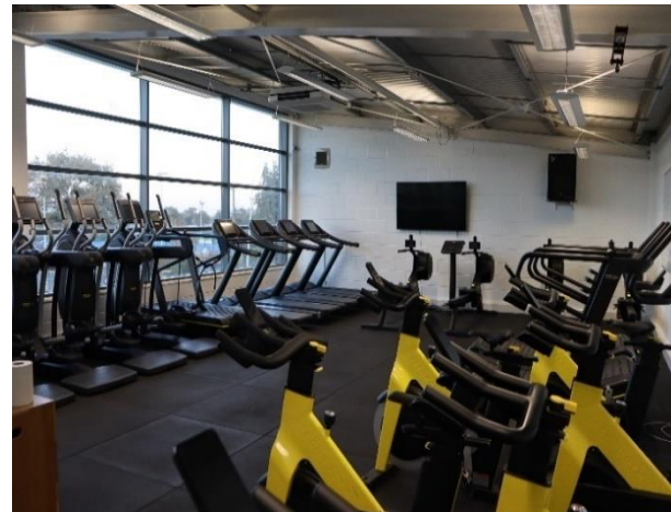
Indoor swimming pool (above left) and Fitness Suite (above right), available for staff use