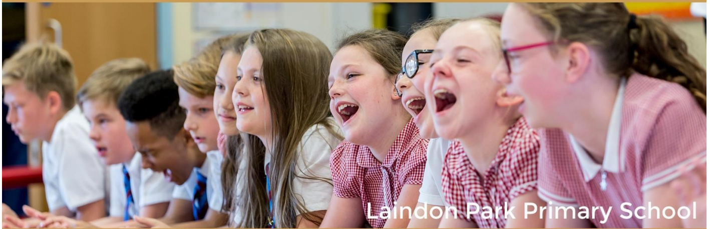
Leindon Park Primary School