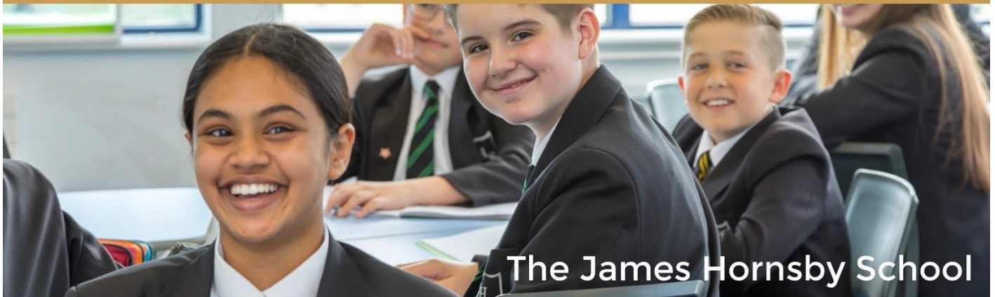
The James Hornsby School