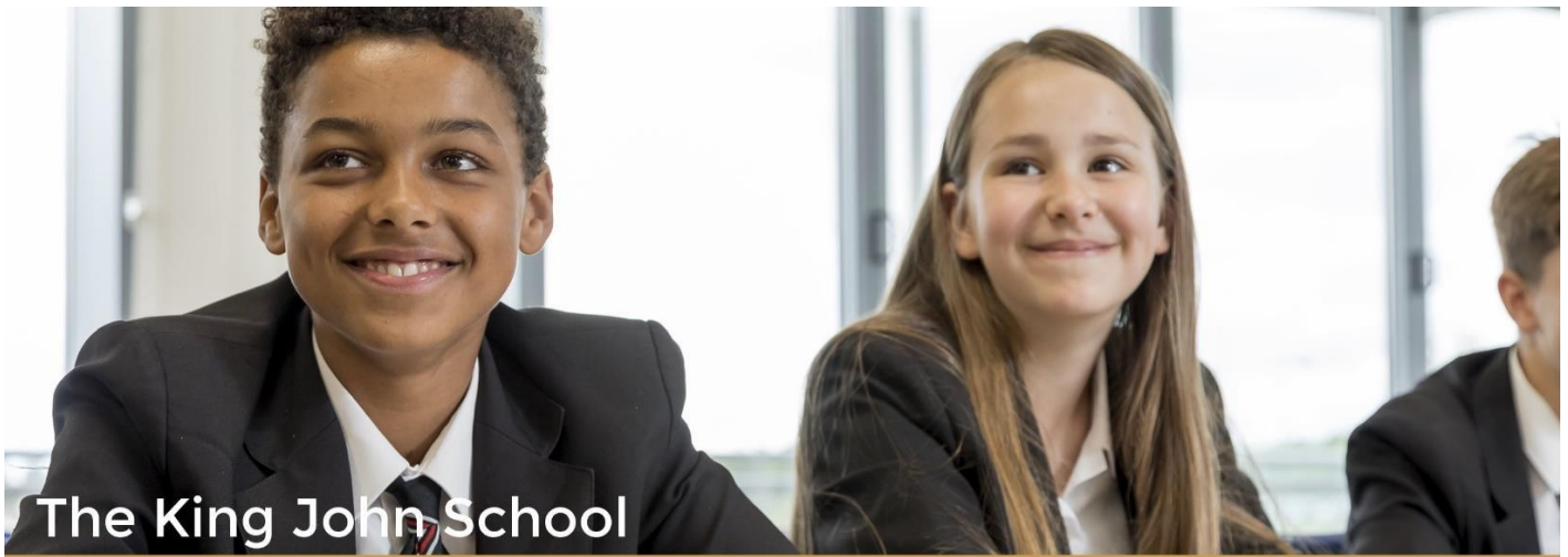
The King John School