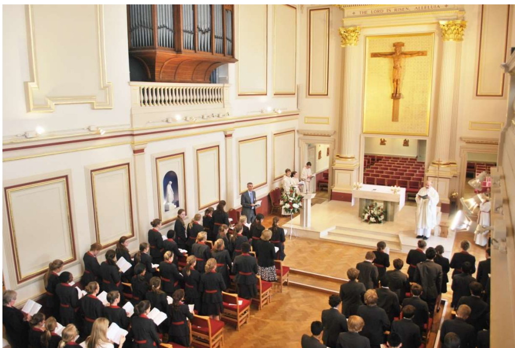
New Hall Chapel

The Chaplaincy Team has the benefit of a dedicated pastoral centre, The Barn, in one of the most historic parts of the campus. The Barn, which is also the base for the New Hall Voluntary Service (NHVS), consists of a main hall, kitchen, an Oratory, offices and beautiful, tranquil gardens, overlooking the duck pond. The School benefits from a beautiful and historic Chapel, which is the heart of the School, and the St Francis Chapel in the grounds of the Preparatory Divisions.