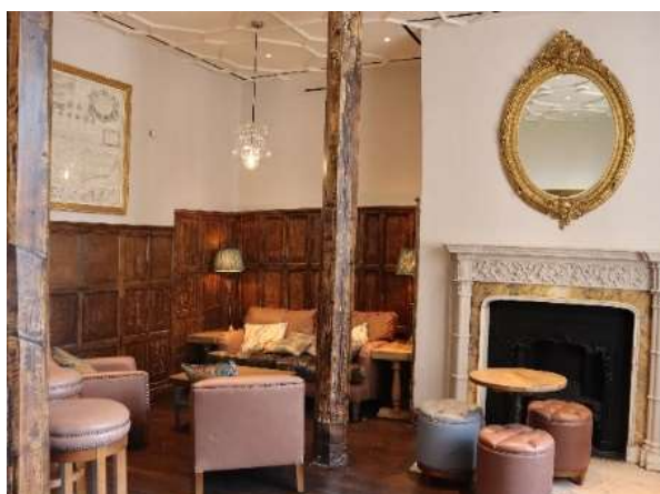
Denford Bar & Lounge (Staff & Sixth Form use)