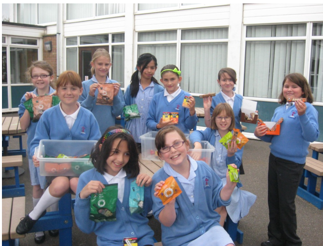
Our Fairtrade Shop in action at break time

St. Teresa's has a thriving school council which meets weekly and is involved in many aspects of school life. At the beginning of each school year two children from Y1 - Y5 classes and 6 from Y6 are voted in by their peer groups with specific responsibilities allocated to Year 6 members. Year 6 council run a weekly stall after school selling Fair Trade items. The stall is also run at break times.