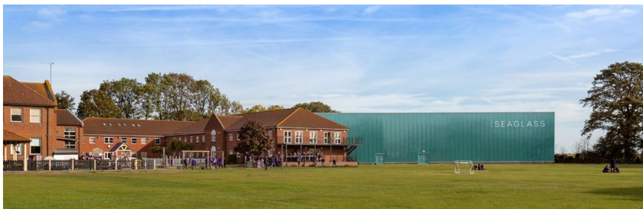
The Seaglass - New Sports & Events Centre