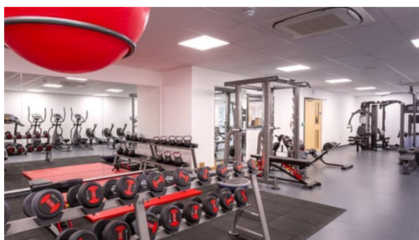
The Seaglass - Fitness Suite