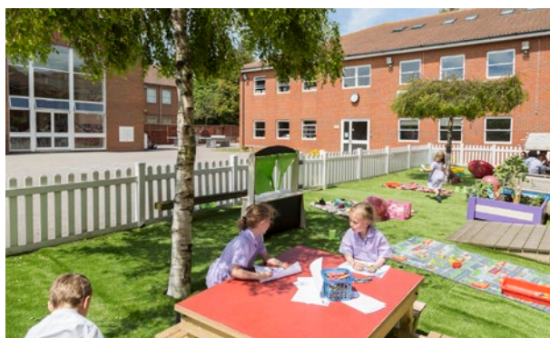
Reception Class Outdoor Classroom